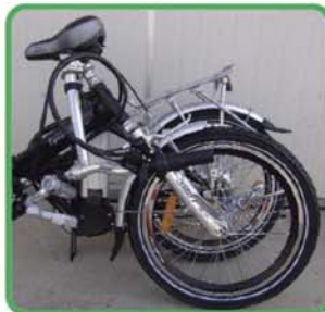
The Phoenix folds down fast and compact