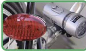
Large, powerful front and rear lights for added safety