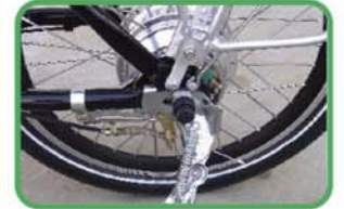
Side stand and powerful DC drive motor