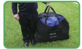
Convenient padded carry bag for security, travel and storage (optional)