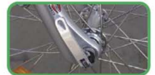
Quick release wheels