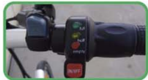
Battery power indicator and Shimano gear change