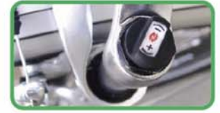
Adjustable front fork action to suit any rider or terrain.