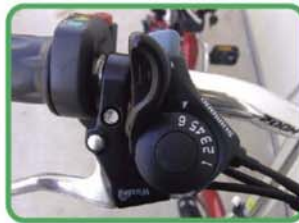
Shimano 6 speed gears