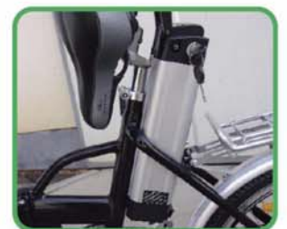
Lithium battery, comes with keyed security lock and flip seat for easy battery removal

All of the Cyclomatic models are made using the highest quality materials and workmanship incorporating the latest technology. They are certified to international quality standards and are CE certified. The Cyclomatic range of electric bicycles are manufactured by a world leader in electric vehicles; including electric cars, resort vehicles, mobility vehicles and other electric driven products. These vehicles are widely distributed in Europe, U.S.A. and other international markets. The production environment, attention to design and quality control are second to none. When choosing a Cyclomatic electric vehicle, you can be assured of the highest quality and performance available.