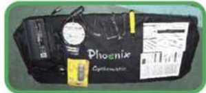
Tool kit and owners manual